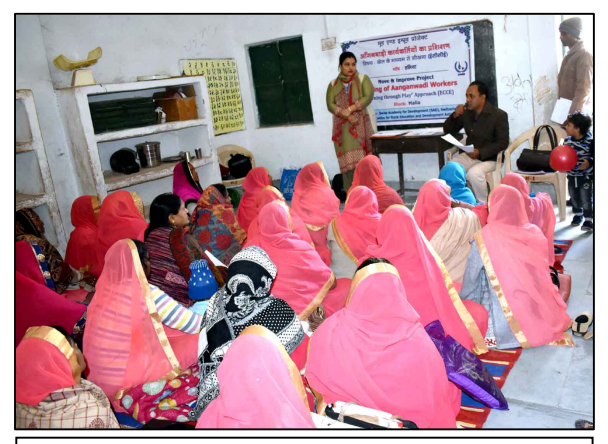
CDPO in Halia block interacting with participants during the AWW training in Halia block