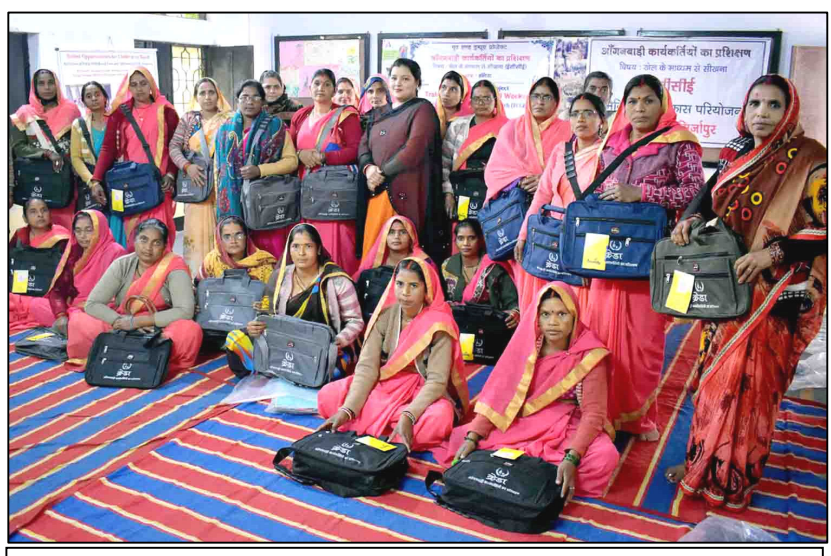
A bag and training materials were provided to each trainee AWWs

AWWs felt that the training module as such will be adopted by them and no any change is needed. Suitability of training itself is a milestone which will change the behavioural pattern and understanding of the children.