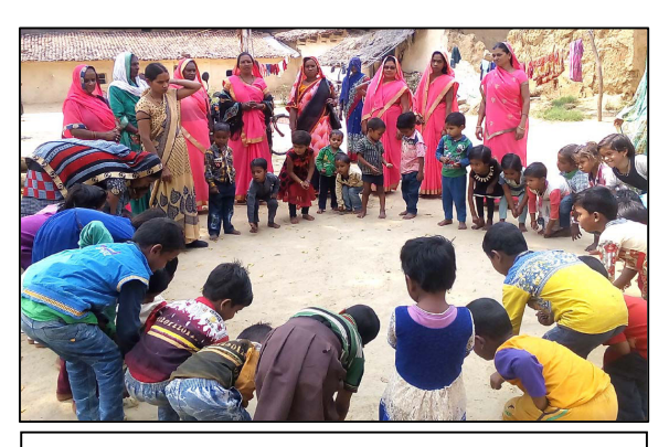
AWWs seeing the activity by children during exposure visit at ECCE Centre, Basuhara

In the opinion of Anganwadi Workers, it was a special and useful training as they said that in past they were not exposed to such training. The training, as they said, has provided better understanding to keep the children of Anganwadi Centre engaged through various types of activities, all activities we have particularly done during the two-day training programme. It is also the feeling of almost all the AWWs that AWC must have proper records and information in poster on walls as of ECCE Centres so that the visitors can have better understanding of the target group and the activities at a glance through the data and drawing elaborations.